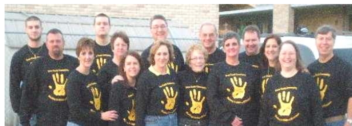
CRCPC 2011 Mission Trippers